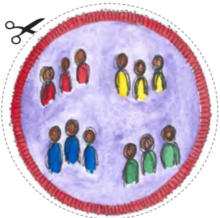
ACTIVITY 5 Harmony Break: Mood Shifting