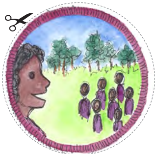
ACTIVITY 9 Harmony Break: Where's the Volume?