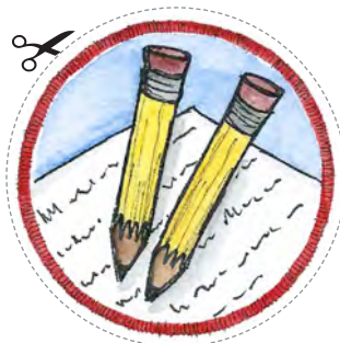
ACTIVITY 7 Write a CoronaKindness Song