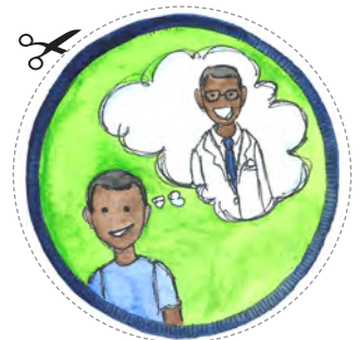
ACTIVITY 8 Write a Poem to Your Future Self