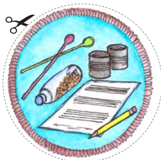
ACTIVITY 6 Harmony Break: Finding Emotions in Music