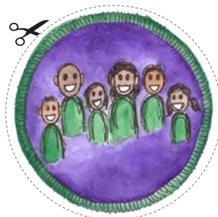
ACTIVITY 10 Harmony Break: Guess the Emotion