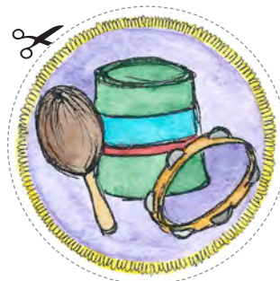
ACTIVITY 11 Make Three Instruments