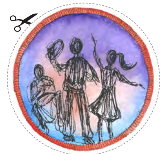
ACTIVITY 12 Harmony Break: Instrument Circle