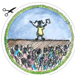
ACTIVITY 14 Perform for Your Community: Empathy Song