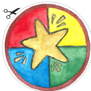
ACTIVITY 3 Teach the Mood Meter