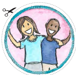
ACTIVITY 13 Write an Empathy Story