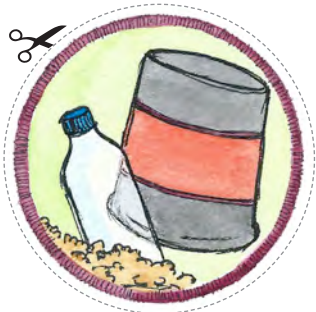
ACTIVITY 1 Make an Instrument