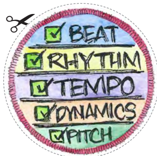
ACTIVITY 2 Teach the Five Elements of Music